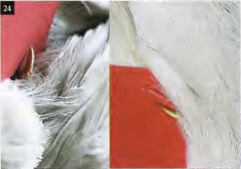
Figure 23. White Swamphen Porphyrio albus in Mathews (1928); for Mathews the spur was motive to remove the species to a new genus, Kentrophorina , as, according to him, no wing claw was present in the type of the genus Porphyrio Figure 24. Detail of the right wing of the Vienna specimen of Lord Howe Gallinule Porphyrio albus showing the spur

the 16 mm difference in culmen length between the specimens; consequently, only the bill measurement of the Vienna bird is reliable. In coloration, the Vienna skin is pure white, whereas the Liverpool skin has individual blackish-blue feathers on the head and neck, blue feathers on the breast and a few purple-blue feathers on the back and shoulders (Fig. 20). From the distribution of the coloured feathers, we were able to reconstruct the natural purple-blue coloration of this extinct species (Fig. 21). It differed primarily from other Porphyrio (Fig. 22) in having the lores, forehead, crown, nape and hindneck blackish blue, the mantle, back and wings purple-blue, rump and uppertail-coverts darker, and underparts all dark greyish blue.